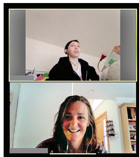
Mentor and mentee catch up via Zoom.

Under these conditions, mentors become a beacon of light for their mentees. Mentors check in regularly, reassuring mentees that things will get better. Virtual relationships are not always easy, but mentors are finding